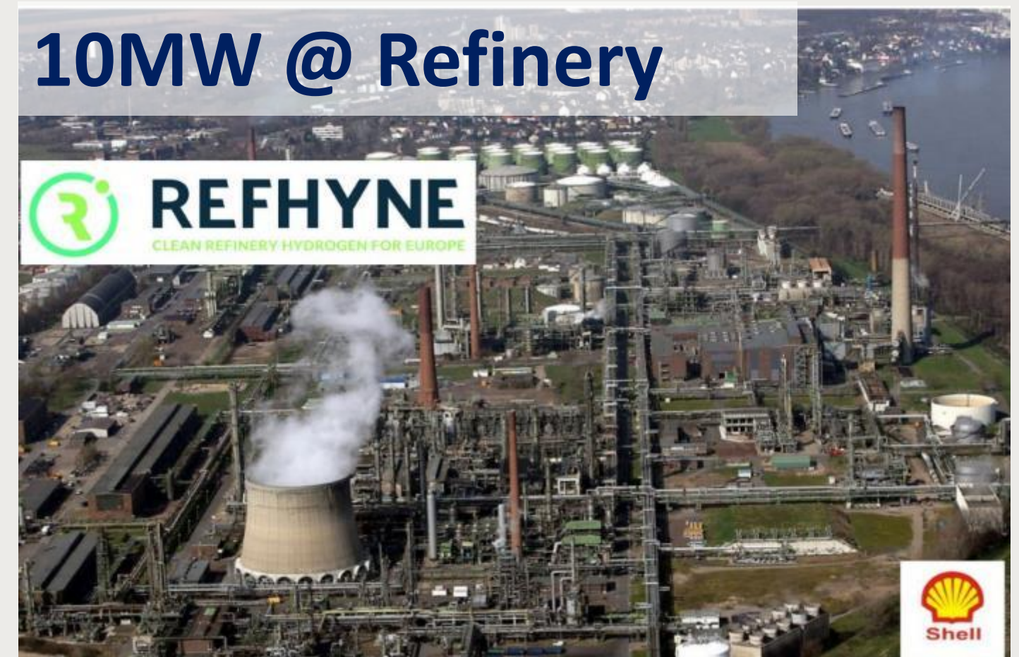
10MW @ Refinery